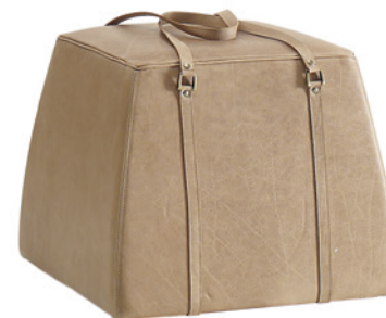
Pelle in tuscanly corda. Tuscanly corda leather.