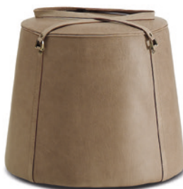
Pelle in tuscanly corda. Tuscanly corda leather.