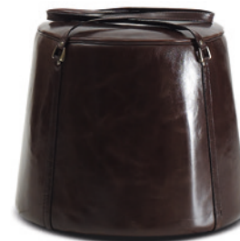
Pelle in tuscanly brunello. Tuscanly brunello leather.