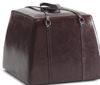
Pelle in tuscanly brunello. Tuscanly brunello leather.