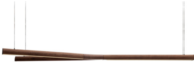
Noce americano. American walnut .

Structure: constructed in solid American walnut with integrated LED and glossy black metal end caps. Fixings: ceiling mounting included. End Caps: metal, available in Ulivi Salotti finishes. Customization: length can be adjusted upon request.