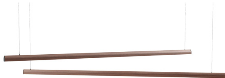
Noce americano. American walnut .